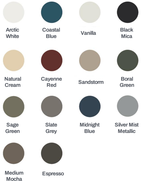
Black Mica Fiberglass picture / casement window

The residential grade paint that is most like the coating we use is Sherwin Williams Duration. Our gloss level is 25 degrees – between flat and satin finish.